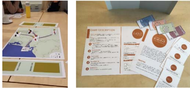
Fig. 1. Prototype of the Trust Game

Developing a simulation game where the concept of trust is central, we started from the reality aspect. As aforementioned, we focus our research on the transportation sector. To create a deeper understanding of the characteristics of the transportation sector, we first conducted a system analysis. Derived from scientific and grey literature, information streams, business processes and actors in the systems could be identified. Based on the business process modelling approach, the actors and their processes are visualized through swimming lanes. Our analysis shows that business processes are highly interdependent and aligning processes and decisions can be challenging. Based on the system analysis, we can decide which roles in the game should be represented. As truck platooning serves as the technological innovation where we can study the role of trust on collaboration, we also looked into this innovation in particular. Truck platooning is not yet implemented in reality. To let transportation experts experience the influence of trust while truck platooning, we defined a future scenario where truck platooning is implemented as transport mode for the distribution of goods via the road. The purpose of this game is not only to study the role of trust on collaboration but also to create awareness among practitioners.